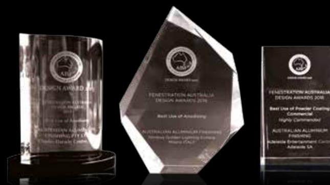
Award winning Anodising and Powder Coating.

With 200 dedicated personnel, our experienced finishing team is ready to provide unbiased technical advice about all finishing, anodising and powder coating along with customer support in tailoring colours and performance to project needs.