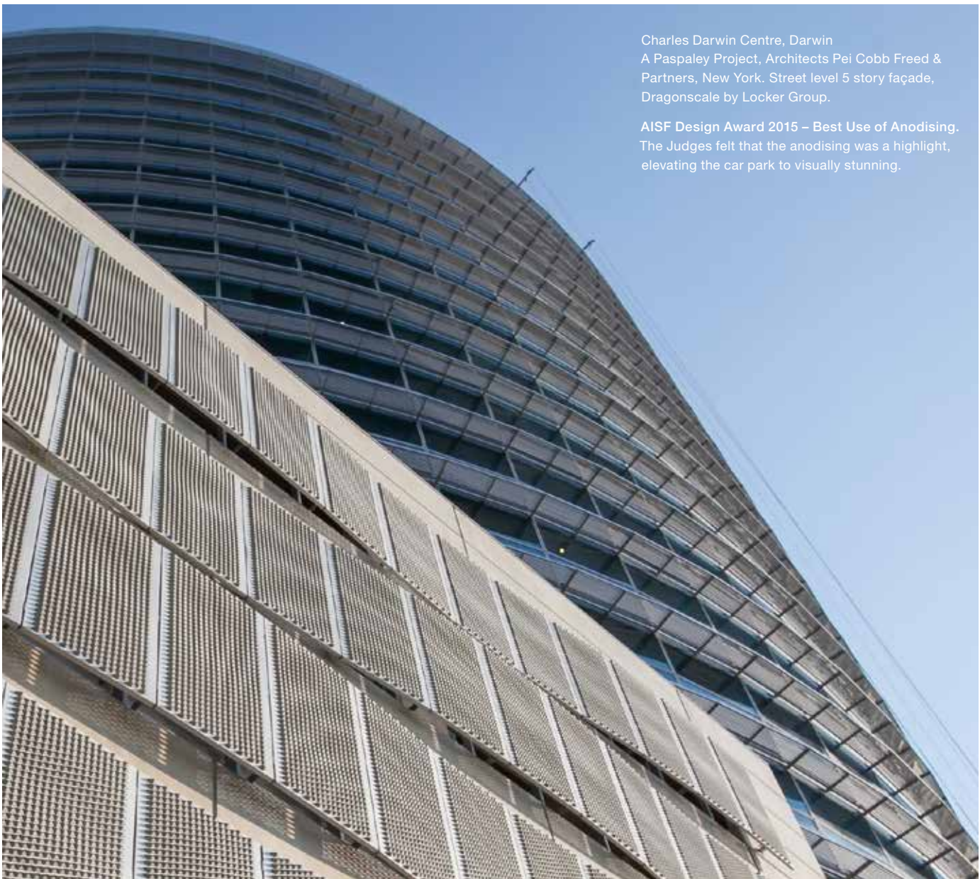
Charles Darwin Centre, Darwin A Paspaley Project, Architects Pei Cobb Freed & Partners, New York. Street level 5 story façade, Dragonscale by Locker Group. AISF Design Award 2015 – Best Use of Anodising. The Judges felt that the anodising was a highlight, elevating the car park to visually stunning.

The brilliant natural finish of the Evershield® Gold anodising and the superior edge protection of the intricate perforations, provide a long lasting and beautiful finish to the end product.